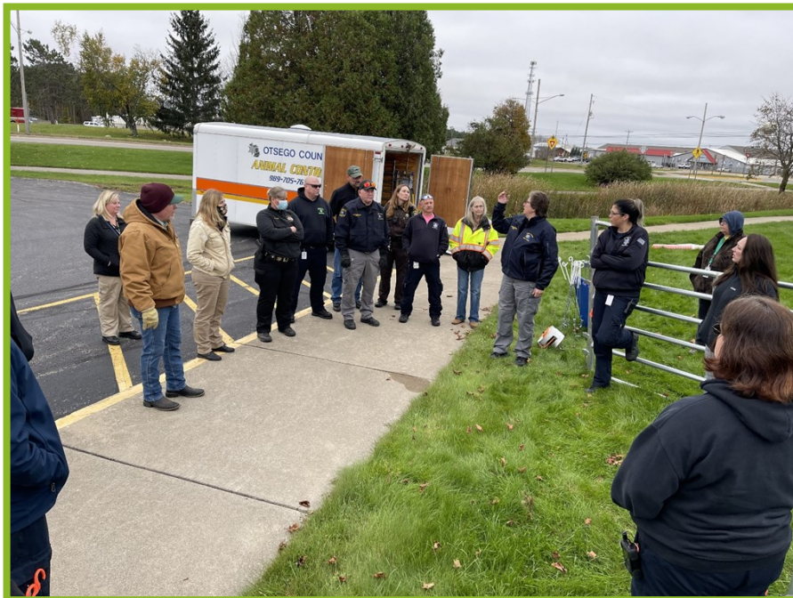
Otsego County E-RAIL Response trailer Deployment and Training – Gaylord 10-27-21

MSU Extension's E-RAIL Team Deploys Emergency Response Equipment Trailers to Assist First Responders with Managing Accidents Involving Animals.